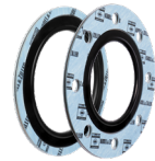
G-ST-P / HYBRID