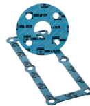
NON ASBESTOS GASKETS